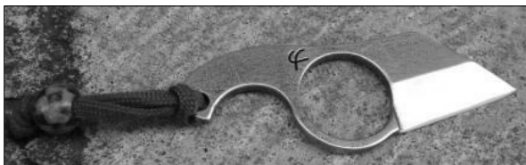
Perrin Le Shark